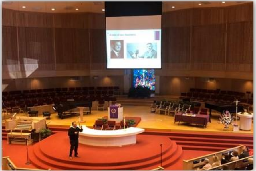
Canoeing the Mountains: Christian Leadership in Uncharted Territory