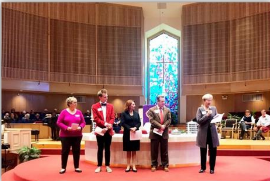
Commissioning the General Assembly Commissioners