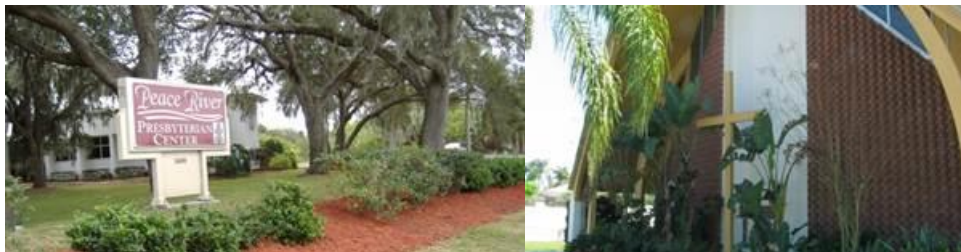
CHURCHES OF PEACE RIVER PRESBYTERY

Mision Peniel Task Force @ Covenant, Fort Myers